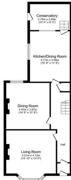
Ground Floor Floor area 78.0 sq.m. (840 sq.ft.)