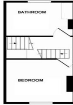
1ST FLOOR APPROX. FLOOR AREA 311 SQ.FT. (28.9 SQ.M.)